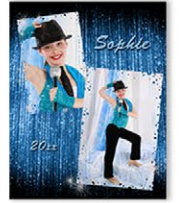
BLUE SPARKLE 2 poses/dances