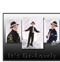
ONYX 3 poses/dances