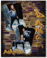
GRAFFITI 2 poses/dances

SPEND $30 or more and benefit from a $10 DISCOUNT on additional montages or bordered prints. Not redeemable for monetary value, not exchangeable.