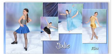
PASTEL 4 poses/dances