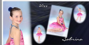
ELEGANCE BLACK 4 poses/dances