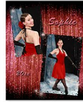
RED SPARKLE 2 poses/dances