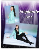
VIOLET STAR 2 poses/dances