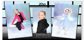
STUDIO 3 poses/dances