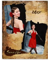
GRUNGE 2 poses/dances