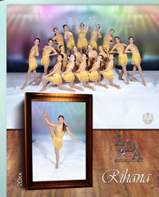
8X10 SCENE COMBO

Not redeemable for monetary value, not exchangeable.