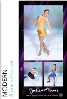
MODERN 3 poses/dances