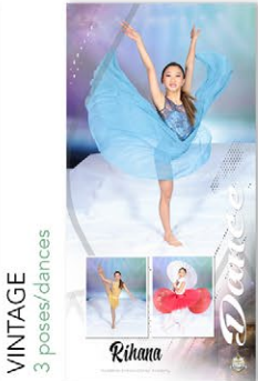
VINTAGE 3 poses/dances