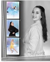
FILM 4 poses/dances