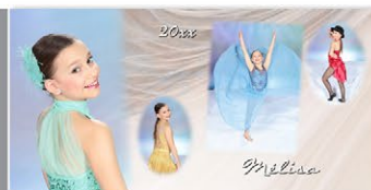
ELEGANCE WHITE 4 poses/dances