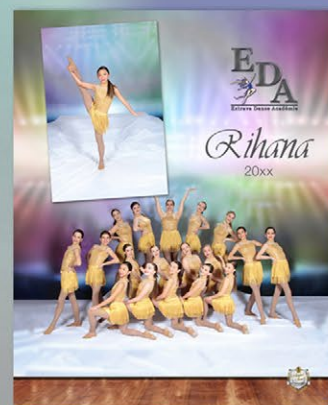
8X10 DANCE COMBO