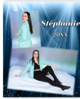
BLUE STAR 2 poses/dances