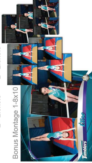
Bonus Montage 1-8x10

2 poses $48 1 - 5x7 1 - 3.5x5 2 - 2.5x3.5